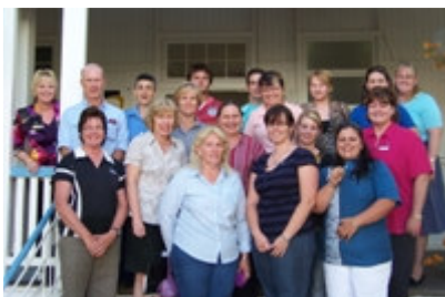
Another proud group of AussieHosts following their completion of the course in Longreach in November last year.

Blackall-Tambo Regional Council is taking advantage of the training and by encouraging all businesses to participate hopes to become the first 'AussieHost Town'.