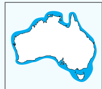
Distribution in Australian waters